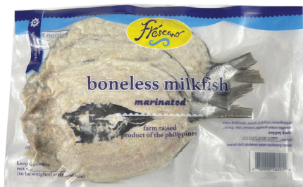
F463BN MILKFISH MARINATED GARLIC/VINEGAR BABY 33 lbs/cs