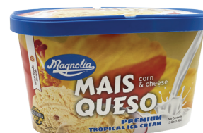
S1891 MAIS QUESO* 6 pack / 1.5 qts