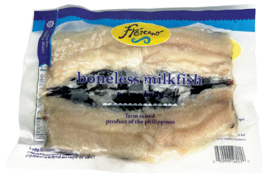
F446N MILKFISH BELLY PREMIUM CUT (DESCALED) 33 lbs/cs