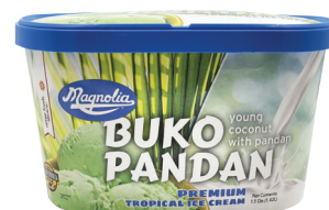
S1809 BUKO PANDAN* 6 pack / 1.5 qts