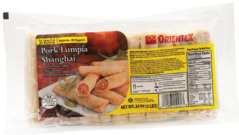
O100B PORK LUMPIA SHANGHAI 12 / 2 lbs