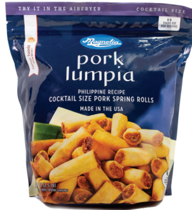
M315 PORK LUMPIA 8 / 2.5 lbs