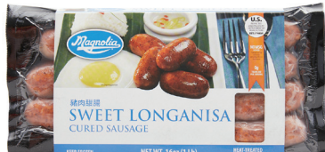
M198 COOKED PORK LONGANISA 12 / 16 oz