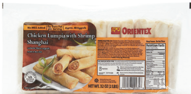
O117B CHICKEN WITH SHRIMP LUMPIA SHANGHAI 12 / 2 lbs