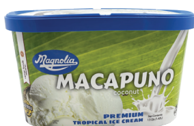
S1841 MACAPUNO* 6 pack / 1.5 qts