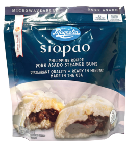
BB1101 PORK ASADO SIOPAO 2 OZ 12 / 16 oz