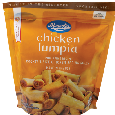
M317 CHICKEN LUMPIA 12 / 1.5 lbs