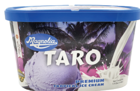
S1807 TARO 6 pack / 1.5 qts