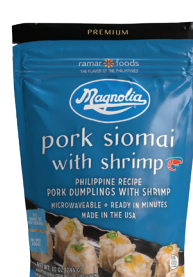
B1005 PORK WITH SHRIMP SIOMAI 20 / 10 oz