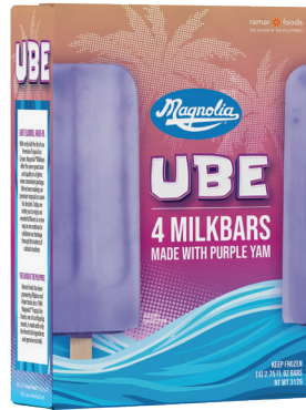
1611N UBE 4 pack / 312 g