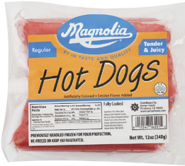
M703 REGULAR 24 / 12 oz