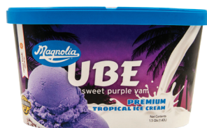
S1811 UBE* 6 pack / 1.5 qts