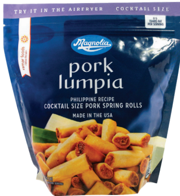
M316 PORK LUMPIA 12 / 1.5 lbs