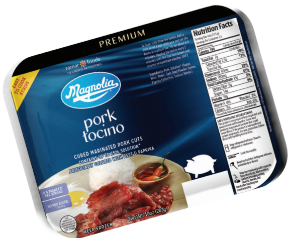
M173 PORK TOCINO 24 / 10 oz

This traditional Filipino breakfast meat is renowned for its sweet and savory taste, achieved through a blend of sugar, soy sauce, vinegar, garlic, and annatto for color.