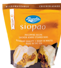
B1200 CHICKEN ASADO SIOPAO 5 OZ 12 / 20 oz