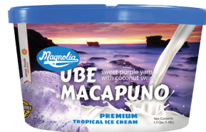
S1894 UBE MACAPUNO* 6 pack / 1.5 qts