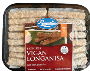
MV146 SKINLESS VEGAN LONGANISA (NO COLOR) 12 / 16 oz