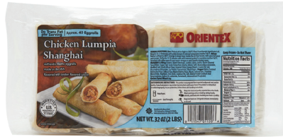
O095B CHICKEN LUMPIA SHANGHAI 12 / 2 lbs