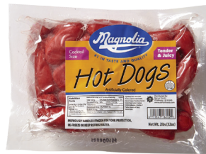
M705 COCKTAIL REGULAR 12 / 2 lbs