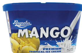
S1821 MANGO* 6 pack / 1.5 qts