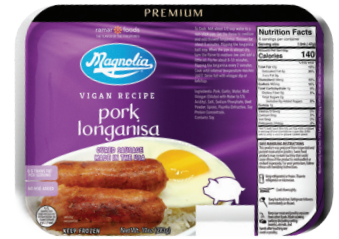
MV143 VIGAN PORK LONGANISA 24 / 10 oz