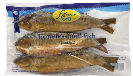
F455BN MILKFISH BONELESS SMOKED BABY 33 lbs/cs