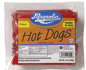
M708 CHEESE REGULAR 24 / 12 oz