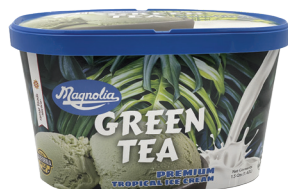
S1898 GREEN TEA* 6 pack / 1.5 qts