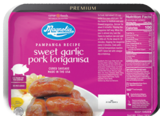
P143 SWEET GARLIC PORK LONGANISA 24 / 10 oz