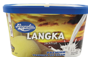
S1831 LANGKA* 6 pack / 1.5 qts