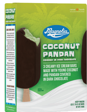
1651 COCONUT PANDAN 3 pack / 240 g