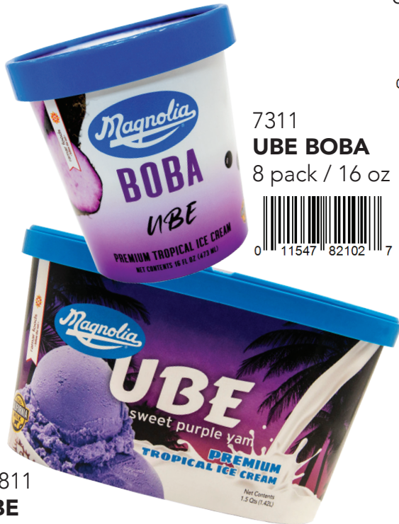
7311 UBE BOBA 8 pack / 16 oz