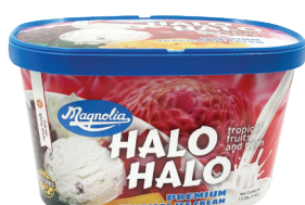
S1861 HALO-HALO* 6 pack / 1.5 qts