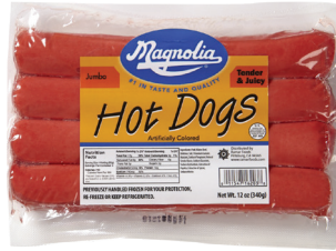
M704 JUMBO 24 / 12 oz