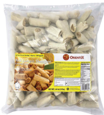
O271 PORK LUMPIA SHANGHAI COCKTAIL 6 / 4 lbs