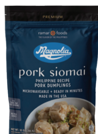
M1005 PORK SIOMAI 10 OZ 20 / 10 oz