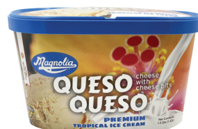
S1890 QUESO QUESO* 6 pack / 1.5 qts