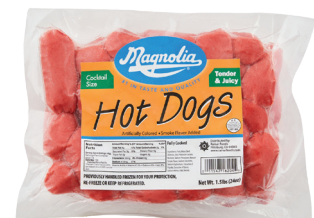
M707 COCKTAIL REGULAR 14 / 24 oz