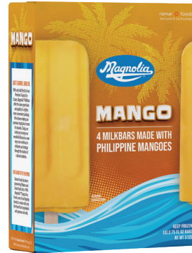
1621 MANGO 4 pack / 312 g