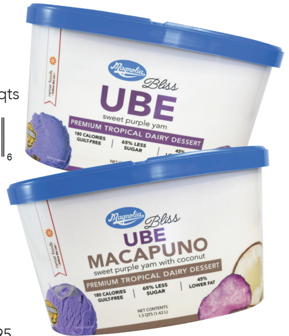
S1895 BLISS UBE MACAPUNO 6 pack / 1.5 qts