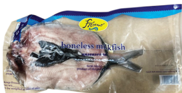
F440N MILKFISH BONELESS BUTTERFLY 33 lbs/cs