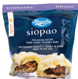
B1100 PORK ASADO SIOPAO 5 OZ 12 / 20 oz