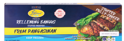
F434N RELLENONG BANGUS 454G / 24 / CASE