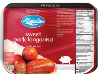
M143 SWEET PORK LONGANISA 24 / 10 oz

Longanisa is a type of sausage from the Philippines, celebrated for its delightful blend of sweet and savory flavors. It's a beloved breakfast item often served alongside garlic fried rice and fried eggs, creating a classic morning meal. Regional variations add their distinct twists to the flavor profile.