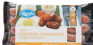
M196 COOKED CHICKEN LONGANISA 12 / 16 oz