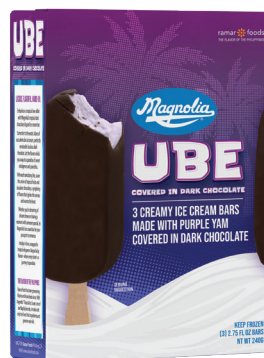
1631 UBE 3 pack / 240 g