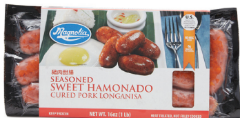
M197 COOKED SWEET HAMONADO LONGANISA 12 / 16 oz