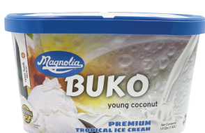
S1851 BUKO 6 pack / 1.5 qts