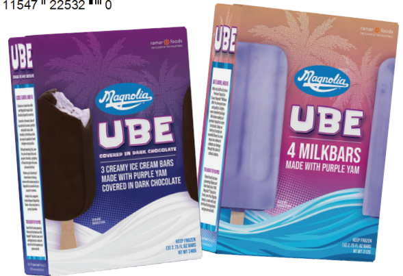
1631 UBE 3 pack / 240 g