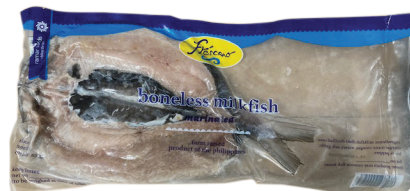
F463LN MILKFISH MARINATED GARLIC/VINEGAR LARGE 33 lbs/cs