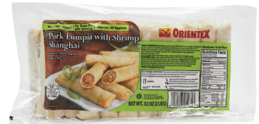
O118B PORK WITH SHRIMP LUMPIA SHANGHAI 12 / 2 lbs