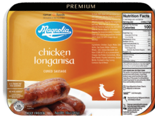
M163 CHICKEN LONGANISA 24 / 10 oz