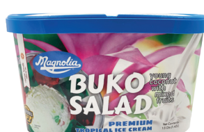
S1805 BUKO SALAD* 6 pack / 1.5 qts