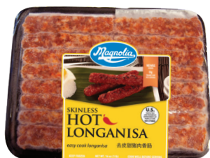
M154 SKINLESS HOT LONGANISA 12 / 16 oz