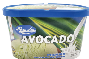
S1800 AVOCADO* 6 pack / 1.5 qts