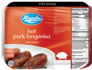
M153 HOT PORK LONGANISA 24 / 10 oz