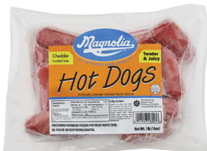
M709 CHEESE COCKTAIL 18 / 16 oz