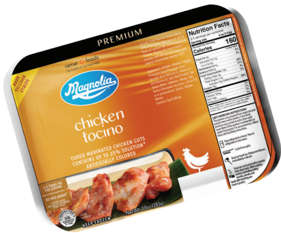
M184 CHICKEN TOCINO 24 / 10 oz