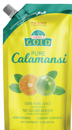
4010S PURE CALAMANSI SPOUT 24 / 7 oz