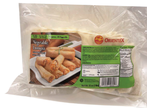
O098B ALL VEGETABLE LUMPIA SHANGHAI 10 / 2 lbs