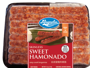
M145 SKINLESS SWEET HAMONADO LONGANISA 12 / 16 oz