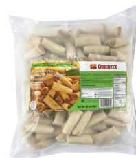
O296 PORK WITH SHRIMP LUMPIA SHANGHAI COCKTAIL 6 / 4 lbs