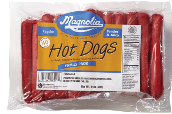
M711 FAMILY REGULAR 4 / 4 lbs