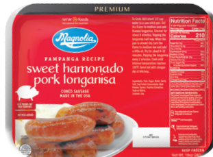
P193 SWEET HAMONADO PORK LONGANISA 24 / 10 oz