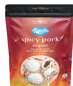
B1210 SPICY PORK SIOPAO 5 OZ 12 / 20 oz