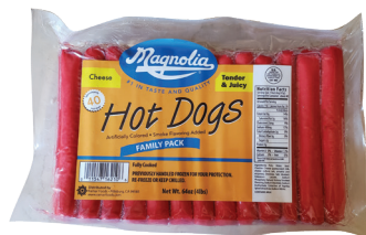
M712 FAMILY CHEESE 4 / 4 lbs