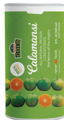
4003C CALAMANSI JUICE CONCENTRATE 12 / 12 oz