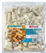
O291 CHICKEN LUMPIA SHANGHAI COCKTAIL 6 / 4 lbs