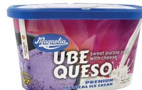
S1812 UBE-QUESO 6 pack / 1.5 qts