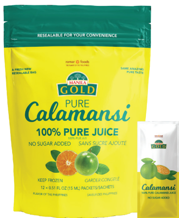
4010M PURE CALAMANSI PACKETS 36 / 12 pk

The small, round calamansi is a citrus with thin skin, adorned with numerous small, prominent oil glands. Maturing from green to yellow and eventually to an orange hue, its juicy, delicate flesh contains small, inedible seeds. Even when fully ripe, calamansi retains its distinctively tart, sour, and acidic flavor. Our Manila Gold® calamansi undergoes cold-pressing, guaranteeing it stays completely natural and pure, free from any additives or preservatives.