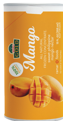
3003M MANGO JUICE CONCENTRATE 12 / 12 oz