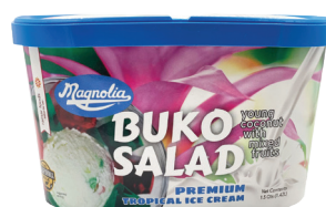
S1805 BUKO SALAD* 6 pack / 1.5 qts