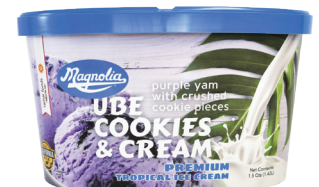
S1814 COOKIES & CREAM 6 pack / 1.5 qts