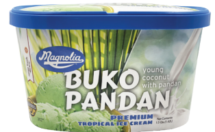
S1809 BUKO PANDAN* 6 pack / 1.5 qts