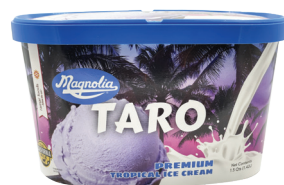
S1807 TARO 6 pack / 1.5 qts