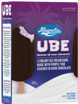
1631 UBE 3 pack / 240 g