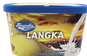
S1831 LANGKA* 6 pack / 1.5 qts