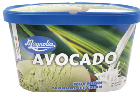
S1800 AVOCADO* 6 pack / 1.5 qts