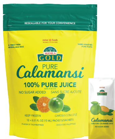
4010M PURE CALAMANSI PACKETS 36 / 12 pk

The small, round calamansi is a citrus with thin skin, adorned with numerous small, prominent oil glands. Maturing from green to yellow and eventually to an orange hue, its juicy, delicate flesh contains small, inedible seeds. Even when fully ripe, calamansi retains its distinctively tart, sour, and acidic flavor. Our Manila Gold® calamansi undergoes cold-pressing, guaranteeing it stays completely natural and pure, free from any additives or preservatives.