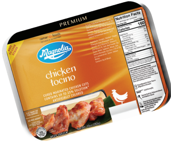
M184 CHICKEN TOCINO 24 / 10 oz