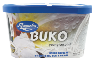
S1851 BUKO 6 pack / 1.5 qts