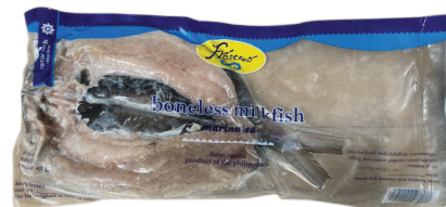
F463LN MILKFISH MARINATED GARLIC/VINEGAR LARGE 33 lbs/cs