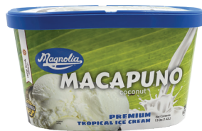
S1841 MACAPUNO* 6 pack / 1.5 qts