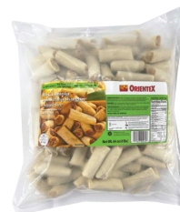
O296 PORK WITH SHRIMP LUMPIA SHANGHAI COCKTAIL 6 / 4 lbs