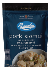
M1005 PORK SIOMAI 10 OZ 20 / 10 oz