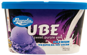
S1811 UBE* 6 pack / 1.5 qts