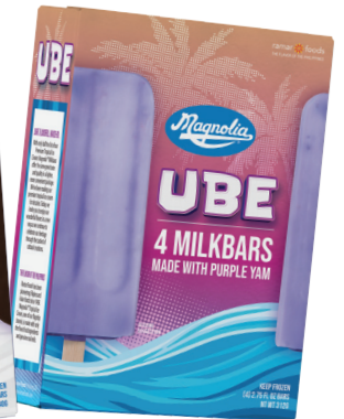
1611N UBE 4 pack / 312 g