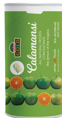
4003C CALAMANSI JUICE CONCENTRATE 12 / 12 oz