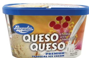
S1890 QUESO QUESO* 6 pack / 1.5 qts