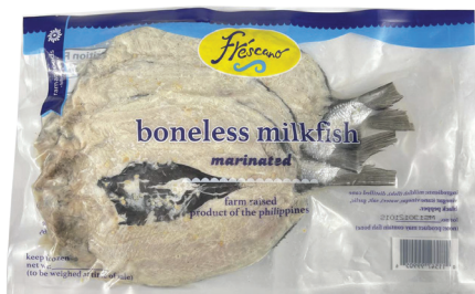
F463BN MILKFISH MARINATED GARLIC/VINEGAR BABY 33 lbs/cs