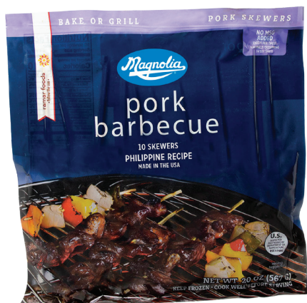
T087 PORK BBQ 10 STICKS 14 / 20 oz

Filipino BBQ skewers are loved for their flavor profile and can be found during outdoor gatherings, fiestas, and street food festivals in the Philippines. They are a delicious and easy-to-enjoy representation of Filipino cuisine.