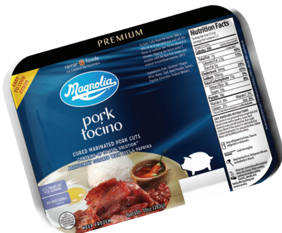
M173 PORK TOCINO 24 / 10 oz

This traditional Filipino breakfast meat is renowned for its sweet and savory taste, achieved through a blend of sugar, soy sauce, vinegar, garlic, and annatto for color.