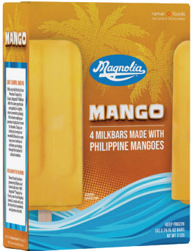
1621 MANGO 4 pack / 312 g