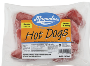
M709 CHEESE COCKTAIL 18 / 16 oz