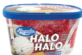
S1861 HALO-HALO* 6 pack / 1.5 qts