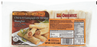
O117B CHICKEN WITH SHRIMP LUMPIA SHANGHAI 12 / 2 lbs