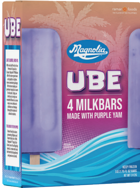
1611N UBE 4 pack / 312 g