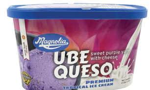
S1812 UBE-QUESO 6 pack / 1.5 qts