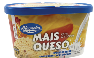
S1891 MAIS QUESO* 6 pack / 1.5 qts