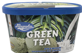
S1898 GREEN TEA* 6 pack / 1.5 qts