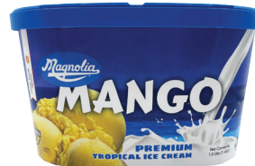
S1821 MANGO* 6 pack / 1.5 qts