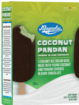
1651 COCONUT PANDAN 3 pack / 240 g