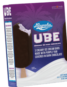
1631 UBE 3 pack / 240 g