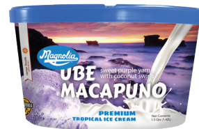
S1894 UBE MACAPUNO* 6 pack / 1.5 qts