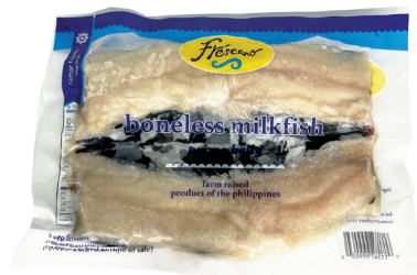
F446N MILKFISH BELLY PREMIUM CUT (DESCALED) 33 lbs/cs