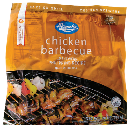
T071 CHICKEN BBQ 10 STICKS 14 / 20 oz